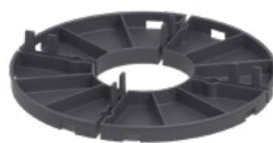
Support pad 10 mm DDP 010 MM