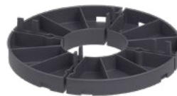
Support pad 15 mm DDP 015 MM