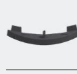
Elastic rubber material of 8 mm support pad