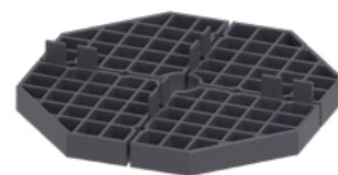
Support pad 16 mm DDP 016 MM

Plastic support pads are designed for use with paving slabs on balconies, flat roofs and terraces. Manufactured from injection moulded high density polypropylene. They are available in three standard sizes, 10mm, 12mm and 15mm thick. All our plastic supports come with 3mm lugs as standard. 10 & 15mm supports can be supplied with 5mm lugs if required on special request. They are designed to stack on top of one another, where installers wish to increase the height of the cavity at intervals – to work around gutter and service pipes, for example. Although lightweight, they are very tough, with a weight tolerance of 400kg per support pad. By suspending the paving, they allow water to run away from the deck underneath. They also help to prevent the build-up of dirt and other material between the slabs. This system eliminates ponding on the upper surface of the roof or balcony paving. 1,2 and 3mm leveling shims are also available to allow for undulations in the roof surface and minor variation in paving slab thickness.