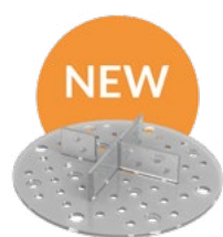
Support pad 2 mm transparent / black availability May 2019

Fixed height support pads with heights 2mm, 8 mm, 10 mm, 15 mm, 16 mm