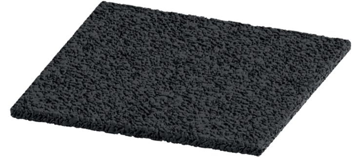
Name SBR PAD

Protection pads allow to use it as barrier between adjustable pedestals and basis of the terrace ( membrane ). Suggested to use when vulcanizing between layers of the pedestal and roof is possible (bituminous membrane). Protection pads gives additional anti noise for the whole terrace construction. Rubber pads are not absorbing water and humidity and has good anti slip attribute.